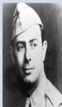
Lt. Alexander D. Goode